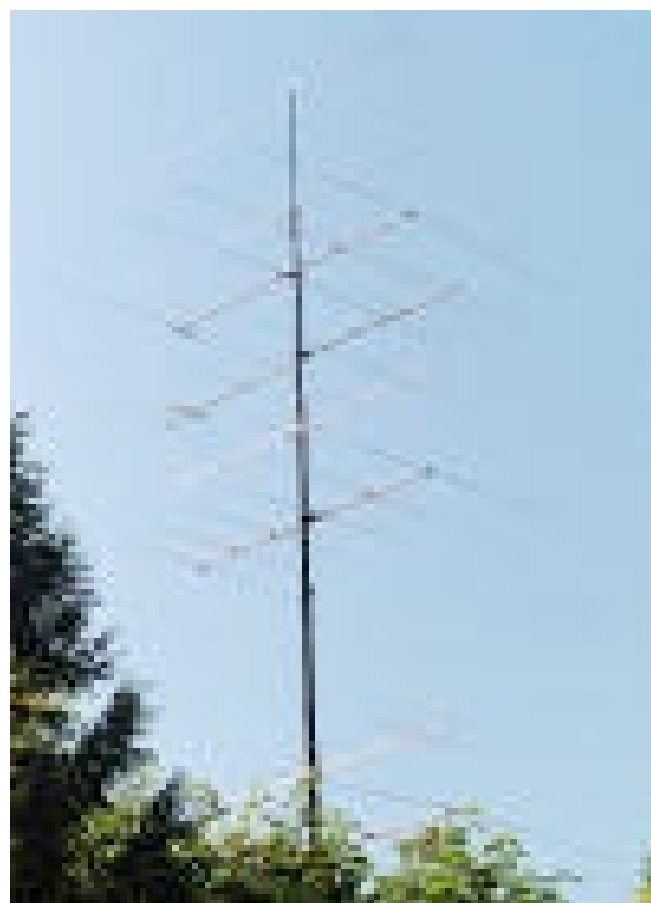
tenna farm (de WB9MCW)